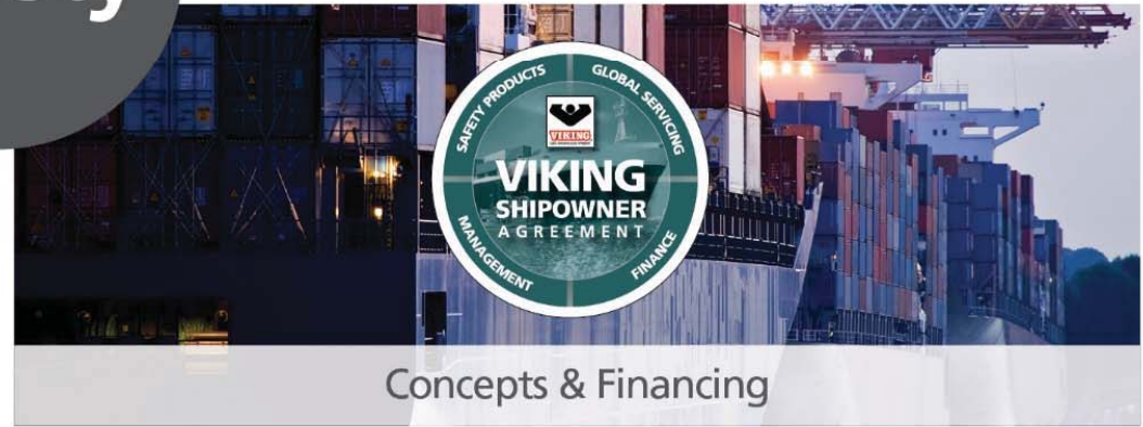
Concepts & Financing