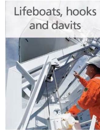
Lifeboats, hooks and davits