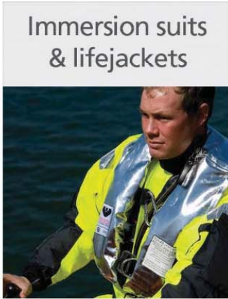
Immersion suits & lifejackets